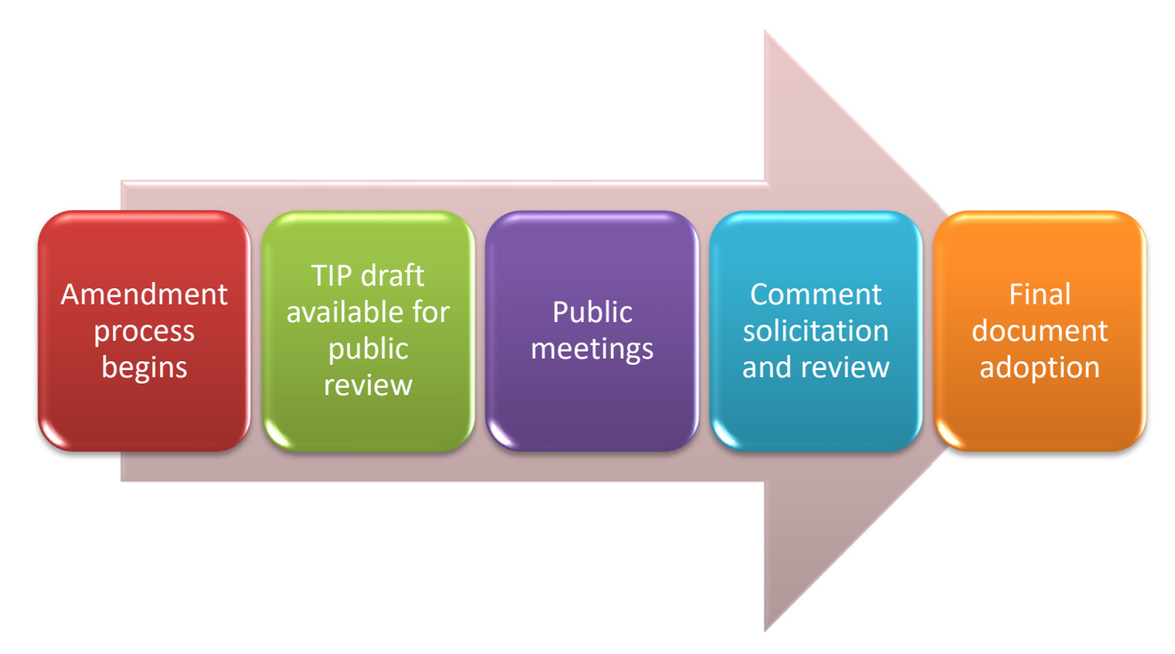
Figure 2: TIP Revision Process